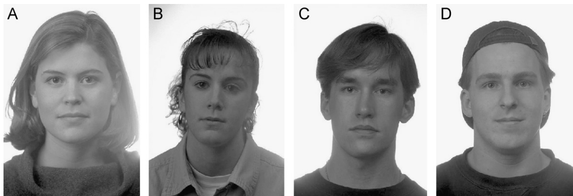
Fig. 1. Sample images taken from the FERET database.